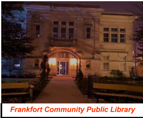
Frankfort Community Public Library