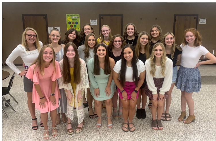
2021 Clinton Prairie Z Club Members (Minus those in quarantine!)