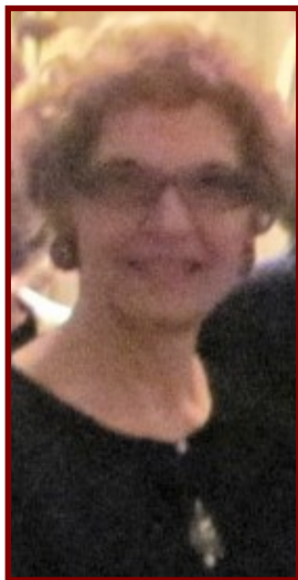
Christmas Party December 2010