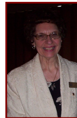
Zonta Club of Frankfort October 2006—50 Year Celebration