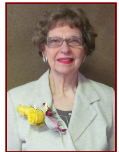
50 Year Zontian May 2011—Annual Meeting