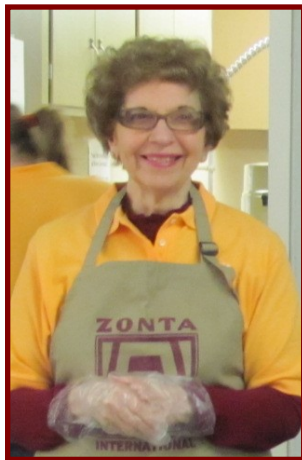
Chicken Noodle Dinner March 2015