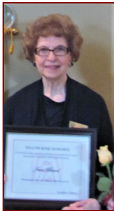
Rose Day March 2013