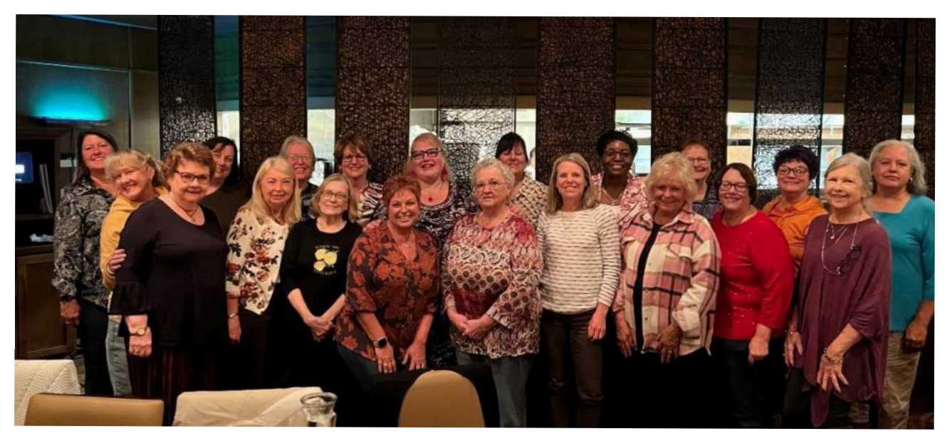
Following the afternoon Board meeting on Thursday, members enjoyed an evening of food and fellowship at a local restaurant.