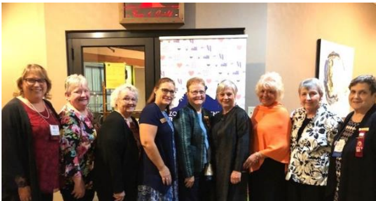
Area 4 Members