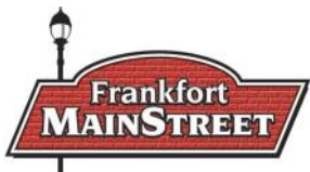
Hotdog Festival — July 29th