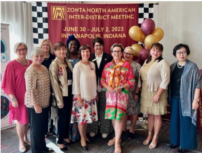
Zonta International Board Members

More about this is planned for the Sept. 13 meeting, so please plan to attend!